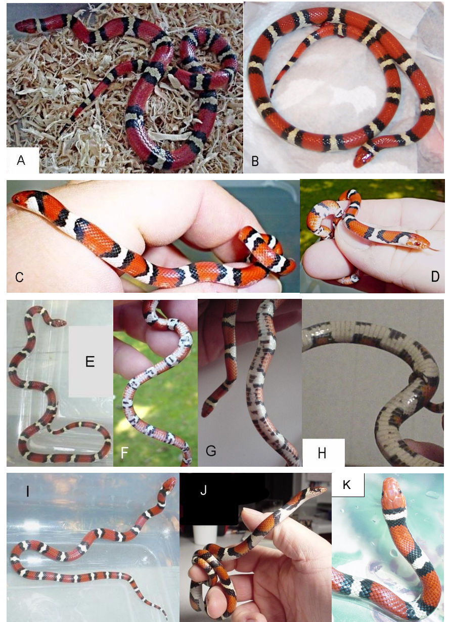
Fig. 3. Scarlet Kingsnakes from Bedford County, Virginia: #1-H, J; #2-B, K; #3-A, G; #7-E; #9-C, D, F, I.