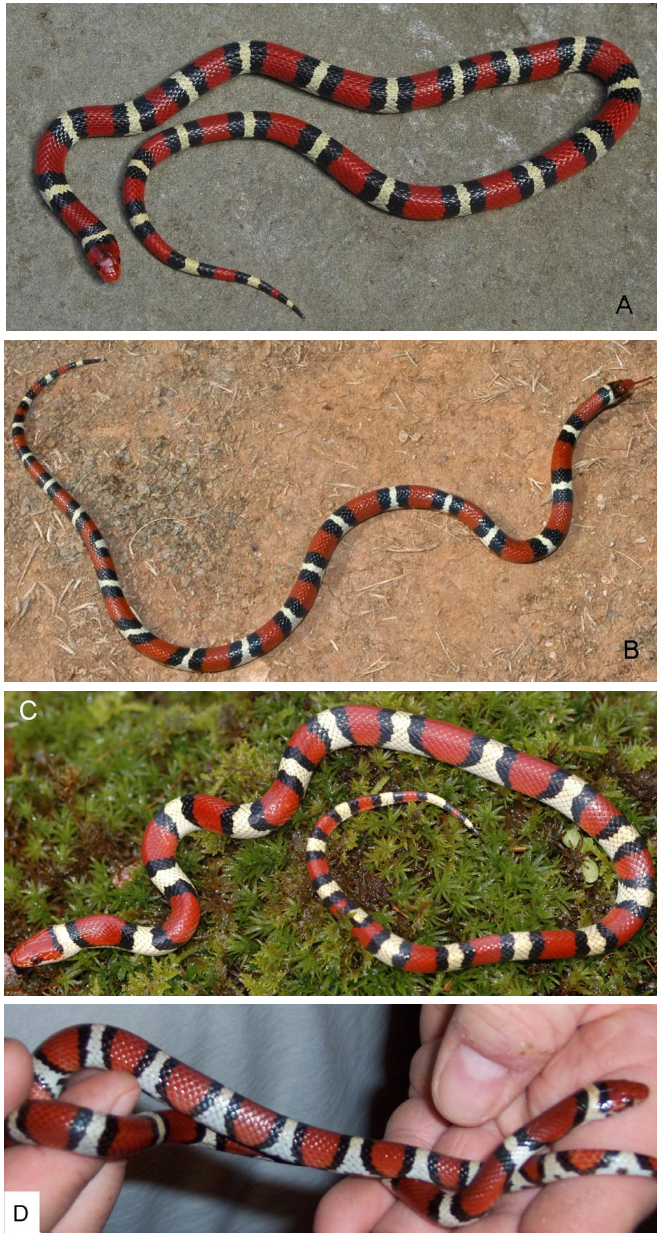
Fig. 2. Scarlet Kingsnakes from Bedford County, Virginia: #1-B; #3-D; #5-A; #11-C.